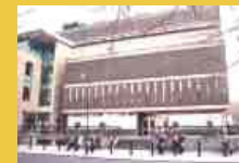
Institute of Psychiatry, London